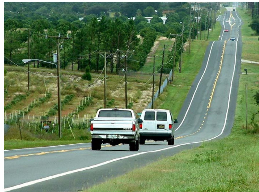
Ridge Scenic Highway south of Dundee.