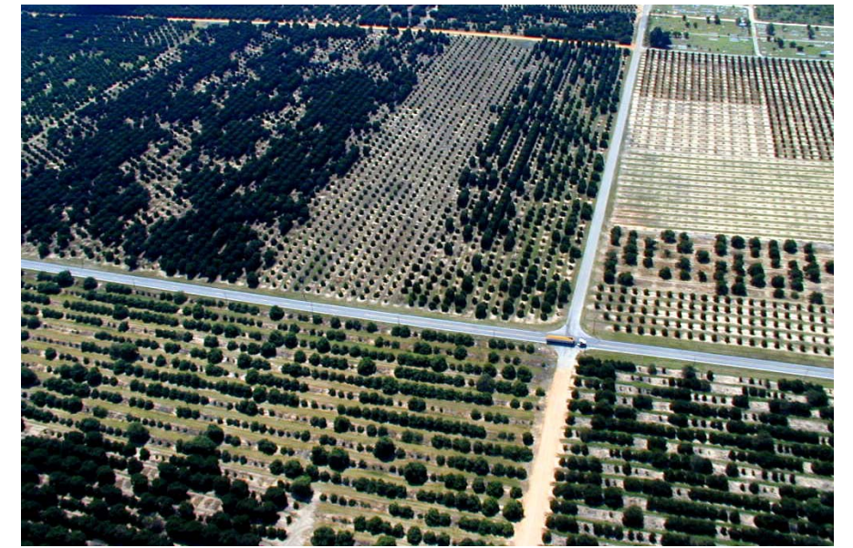
Aerial view of Ridge Scenic Highway in Polk County.