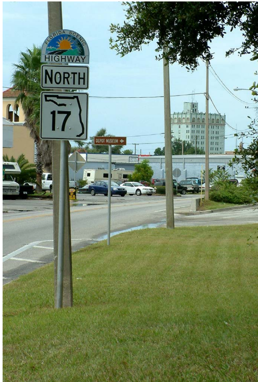
Ridge Scenic Highway approaching Lake Wales.