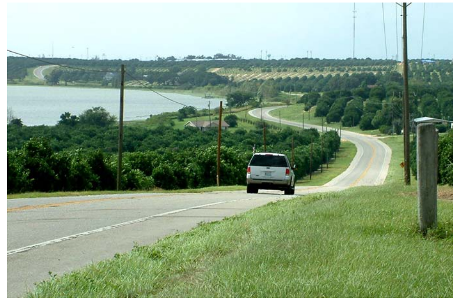
Ridge Scenic Highway north of Lake Moody.